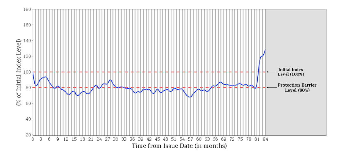
Example #3 — Underlying Index Increases With Payment on the Maturity Date Equal to the Principal Amount