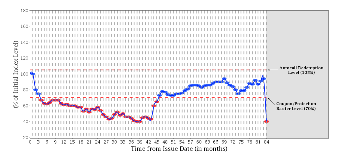
Example #1 — Loss Scenario with Payment on the Maturity Date at Less Than the Principal Amount

The following examples show how the return on the Securities would be calculated under different scenarios. These examples are included for illustration purposes only. The performance of the Underlying Index used in the examples is not an estimate or forecast of the performance of the Underlying Index or the Securities. The actual performance of the Underlying Index and the Securities will be different from these examples and the differences may be material. All examples below assume that a holder of the Securities has purchased Securities with an aggregate Principal Amount of $100.00 and that no Extraordinary Event has occurred. For convenience, each vertical line in the charts below represents both a hypothetical Observation Date and the next succeeding Interest Payment Date. Where applicable, dollar amounts shown below are rounded to the nearest whole cent for ease of reading, but the amount(s) payable to an investor per Security may reflect more decimal places.