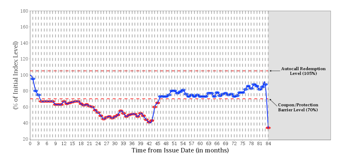
Example #1 — Loss Scenario with Payment on the Maturity Date at Less Than the Principal Amount

The following examples show how the return on the Securities would be calculated under different scenarios. These examples are included for illustration purposes only. The performance of the Underlying Index used in the examples is not an estimate or forecast of the performance of the Underlying Index or the Securities. The actual performance of the Underlying Index and the Securities will be different from these examples and the differences may be material. All examples below assume that a holder of the Securities has purchased Securities with an aggregate Principal Amount of $100.00 and that no Extraordinary Event has occurred. For convenience, each vertical line in the charts below represents both a hypothetical Observation Date and the next succeeding Interest Payment Date. Where applicable, dollar amounts shown below are rounded to the nearest whole cent for ease of reading, but the amount(s) payable to an investor per Security may reflect more decimal places.