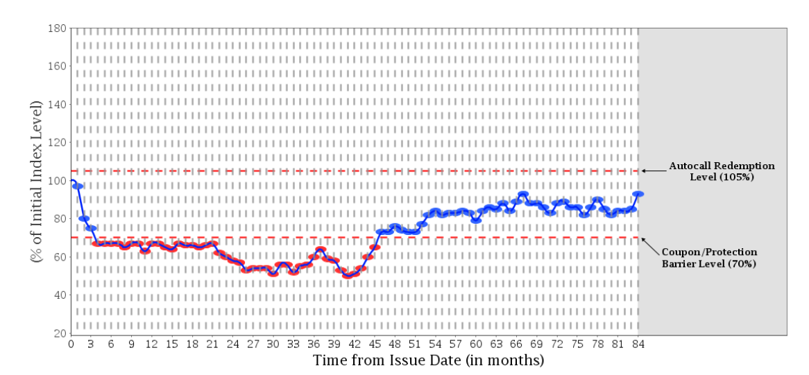
Example #2 — Gain Scenario with Payment on the Maturity Date at the Principal Amount

The equivalent annually compounded rate of return in this example is -3.66%.