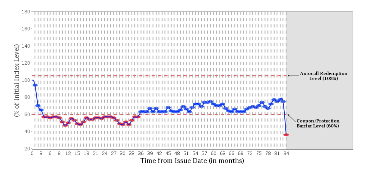
Example #1 — Loss Scenario with Payment on the Maturity Date at Less Than the Principal Amount

The following examples show how the return on the Securities would be calculated under different scenarios. These examples are included for illustration purposes only. The performance of the Underlying Index used in the examples is not an estimate or forecast of the performance of the Underlying Index or the Securities. The actual performance of the Underlying Index and the Securities will be different from these examples and the differences may be material. All examples below assume that a holder of the Securities has purchased Securities with an aggregate Principal Amount of $100.00 and that no Extraordinary Event has occurred. For convenience, each vertical line in the charts below represents both a hypothetical Observation Date and the next succeeding Interest Payment Date. Where applicable, dollar amounts shown below are rounded to the nearest whole cent for ease of reading, but the amount(s) payable to an investor per Security may reflect more decimal places.