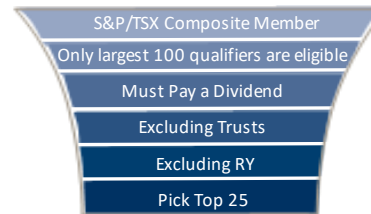
THE UNIVERSE Dividend yielding large-cap Canadian equities